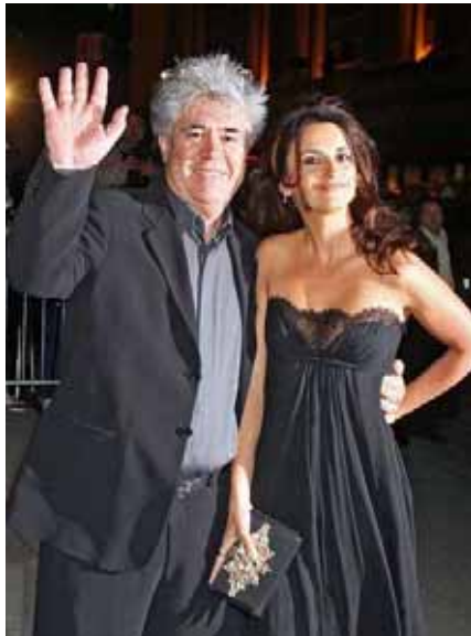
Director Almodovar and Actrice Penelope Cruz

If there was an Oscar for best location, Pedro Almodóvar's Madrid would be firm favourite. Now film fans can tour the director's hot spots. PlusAbroad offers study abroad Spanish language courses with walks through Almodovar's Madrid with specialized guides. Participants visit Almodovar's most famous movie locations and experience the city he portrays. You will participate in a tour of the director's favourite haunts; view 3 of his movies from different periods and partake in a subsequent discussion of the film with an expert. Go on an excursion to La Mancha and visit the village where Almodovar filmed the movie "Volver"; attend a lecture by people from the cinema world.